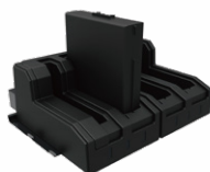
4-bay Battery Charger